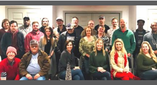
Wiseman Ministries staff and board members would like to wish you a Happy New Year.