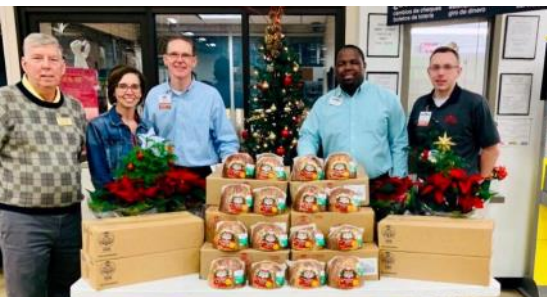
We would like to thank Super 1 Foods for the generous donation of hams to feed our residents during the holiday season.