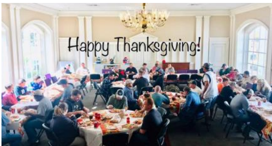
House of Disciples had a wonderful Thanksgiving Celebration.