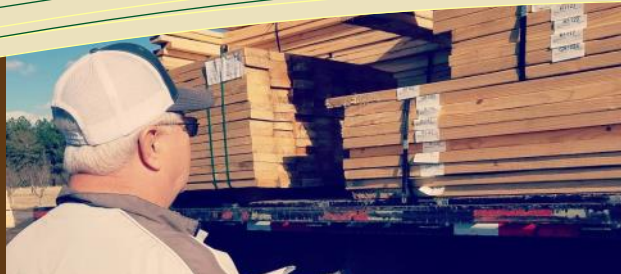
Shipping out Trusses from our Trade School