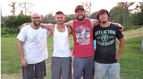
HOD Residents find support and life-long friendships during their time of recovery and restoration.