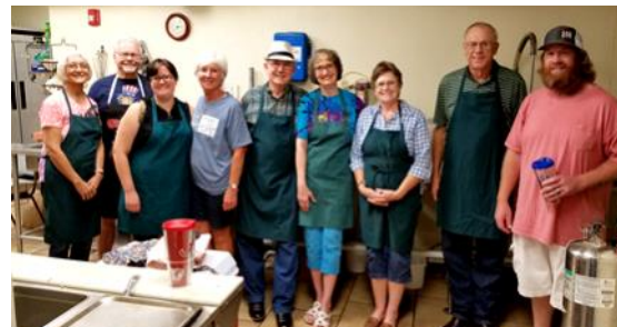
Special thanks to Colonial Hills Baptist Church for providing great food and fellowship at HOD.