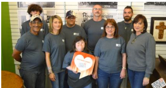
Congratulations to Gifts of Grace Resale Store for being awarded a fan favorite from Locals Love Us.