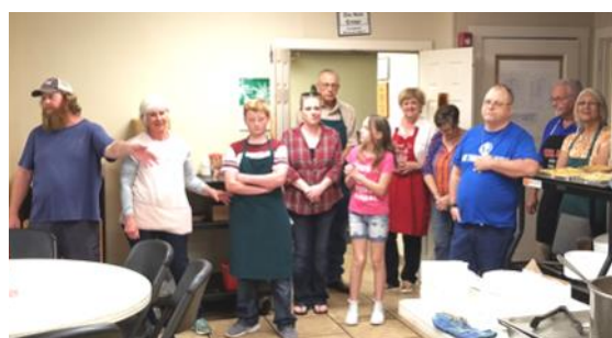
Colonial Hills Baptist Church of Tyler provided dinner and wonderful fellowship.