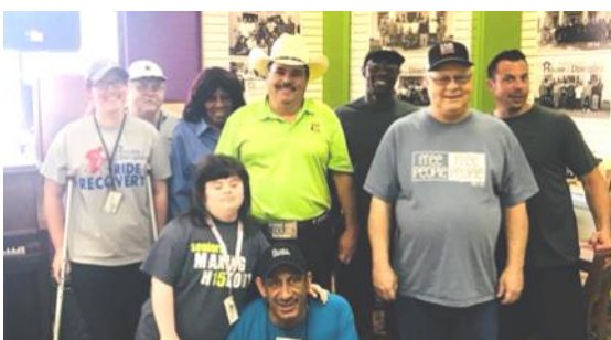
Walt Cade from Storage Wars Texas stops by Gifts of Grace Resale Store.