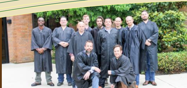
May 2018 Graduates