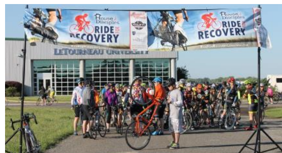
121 cyclists line up at the start of the 1st Annual Ride for Recovery Event.