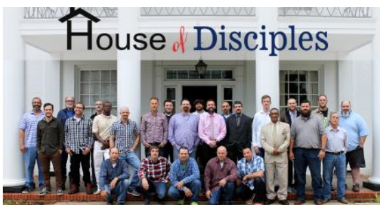
Residents pose for a photo in front of House of Disciples.