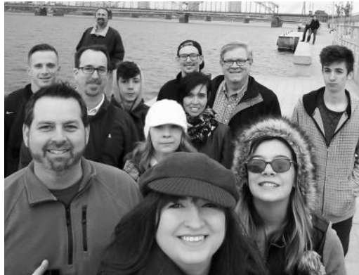
The Wiseman Ministries team pose for a pic in Riga, Latvia, during their mission trip.