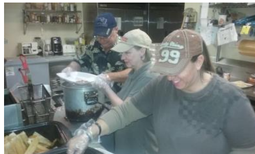
Volunteers from Serenity Church serve dinner to our residents.