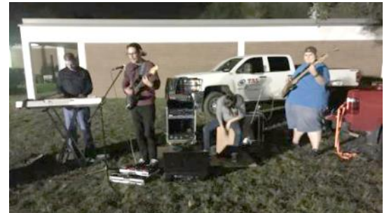
Residents, graduates and staff of HOD lead worship at the Cardboard Box City fundraiser!