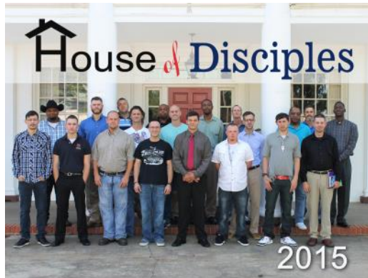
Longview residents pose for yearly photo